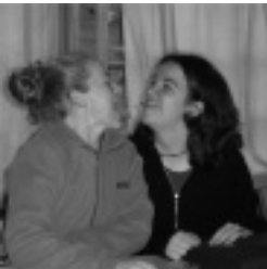
Hard-working Skidmore leaders

Lord, we ask that you bless the leaders of each fellowship. The student leaders will be working hard this year to balance their school work, their extra-curriculars, their friendships, their relationship with God, and their service to their fellowships. Pray that they be blessed with great time management skills, and good delegation skills. Pray that God would continue to fill them up, that their quiet times with God would always be sweet and refreshing.