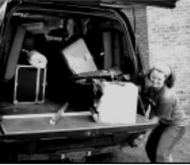
Skidmore move-in, 2002

Lord, we ask that you'd bless us as we reach out to new students. The beginning of the year provides us with great opportunities to meet, serve, and build relationships with new students. At Skidmore, we'll be helping new students move in, surveying the campus about their religious beliefs, and establishing a small group specifically for freshmen. At Union, we'll be handing out cold water during move-in, along with information about the