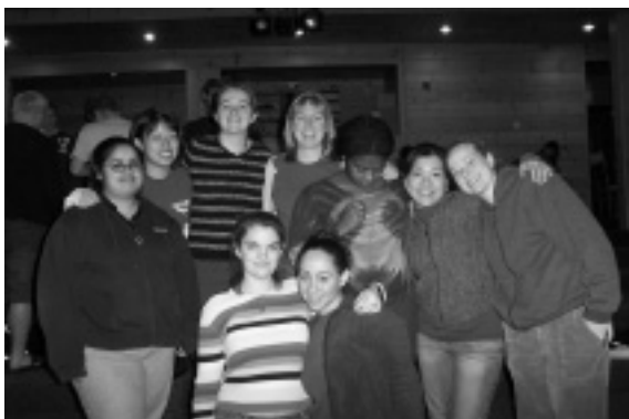
Skidmore students at Basileia '03

Thank you, God, for non-Christians who are pursuing You on both campuses! We had 2 or 3 (out of 8) not-yet-Christian Skidmore students who attended Basileia (our end of the year chapter camp) this year. We also had many non-Christian students drop in on our Bible study and prayer meetings throughout the year at