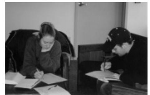
Former Union leaders, planning

Thank you, God, for non-Christians who are pursuing You on both campuses! We had 2 or 3 (out of 8) not-yet-Christian Skidmore students who attended Basileia (our end of the year chapter camp) this year. We also had many non-Christian students drop in on our Bible study and prayer meetings throughout the year at